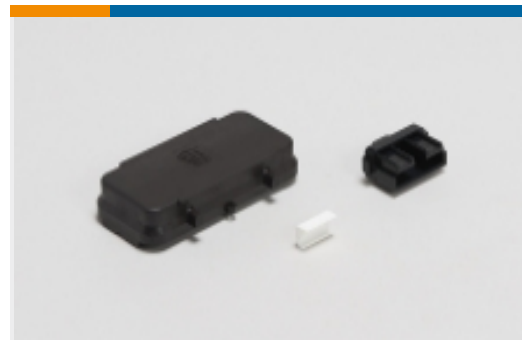
Rectangular Caps &amp; Covers(2)