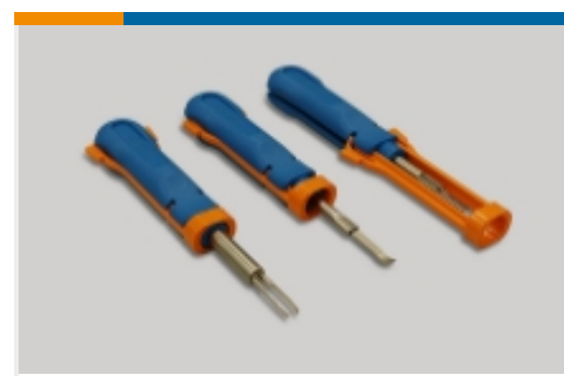
Insertion &amp; Extraction Tools(5)